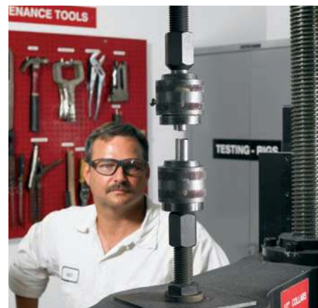
CISPI requires a tensile strength test, as shown, to be conducted every four hours to ensure iron quality.

Some engineers and contractors may wonder why CISPI has such a rigorous quality control inspection program. If they see the ASTM A74 or A888 marked on a piece of pipe, they may automatically assume that someone other than the manufacturer had inspected the material and verified compliance with the standard. That is simply not true. Contrary to popular belief, cast iron soil pipe products are not inspected by ASTM and the ASTM numbers that are typically marked on the products are not even required by the standards. Some importers of foreign-made cast iron pipe and fittings claim that third-party inspections of their plants are required by the code. That is also not the case. In fact, the standard has no requirement for third-party inspections. It clearly states that certification is the manufacturer's responsibility – the entity that poured the iron – and cannot be delegated to a seller or a third-party after the fact. ■