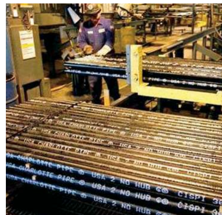
U.S. foundry shows pipe properly marked with country of origin, the name of the manufacturer, and the date it was produced.